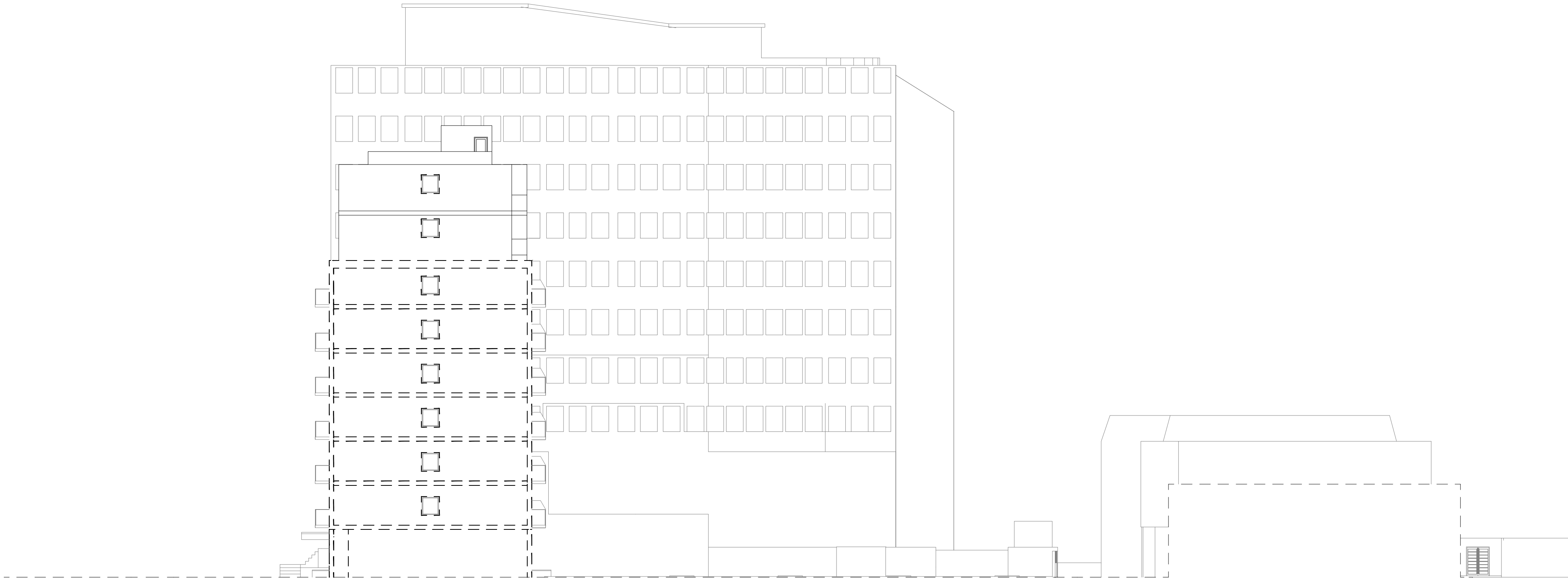
Proposed North Elevation - 1:200